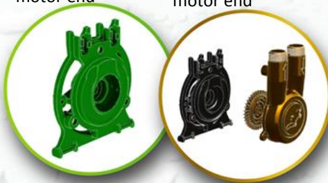
CTFORCE motor end